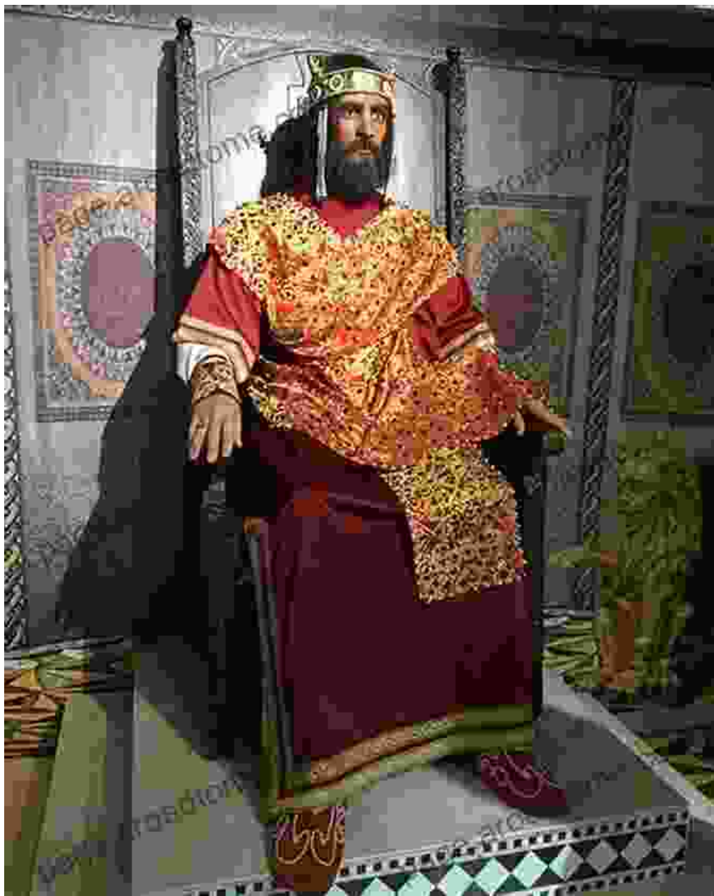
A Byzantine emperor wearing a ceremonial robe