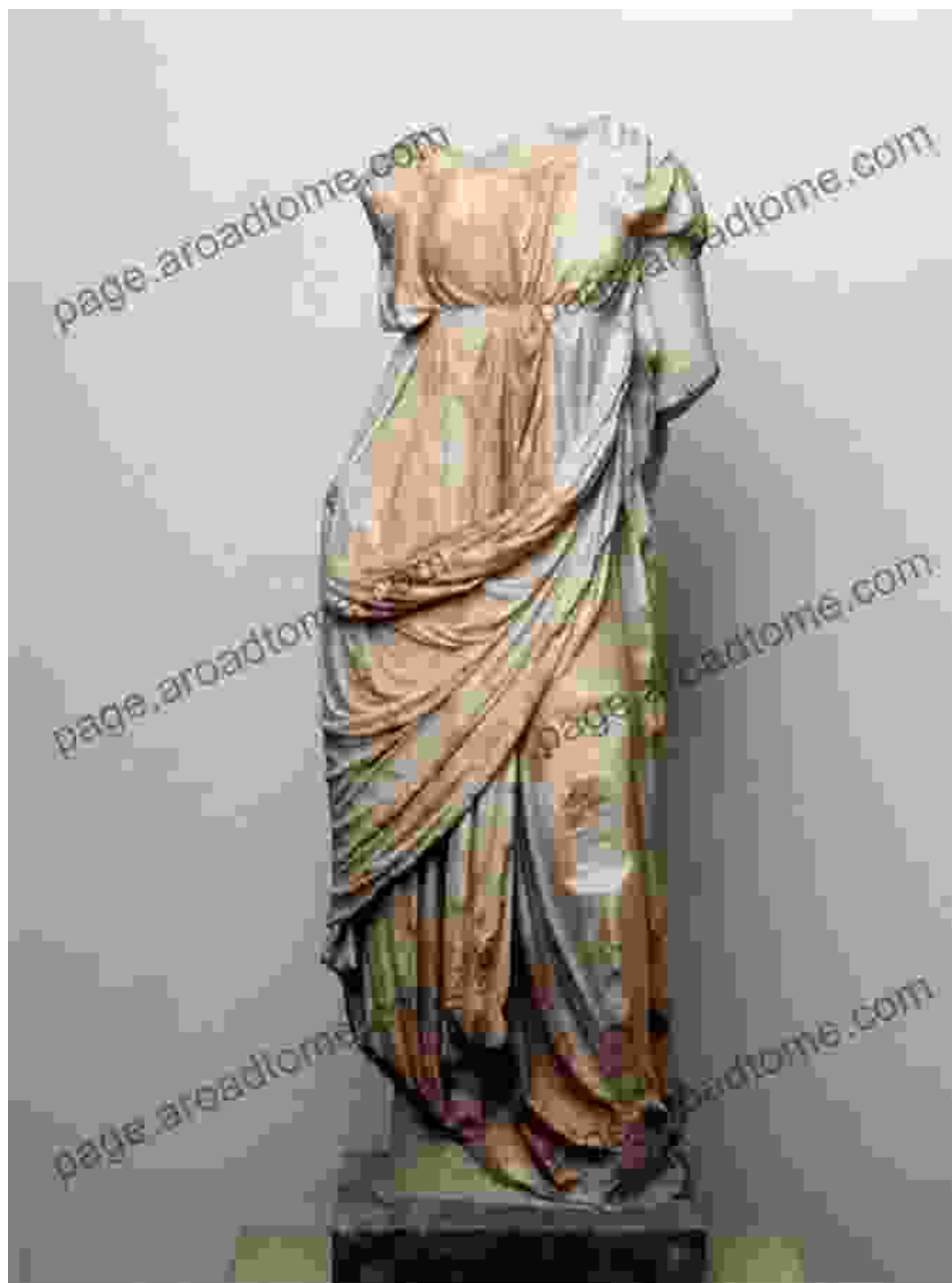
A Greek woman wearing a draped chiton