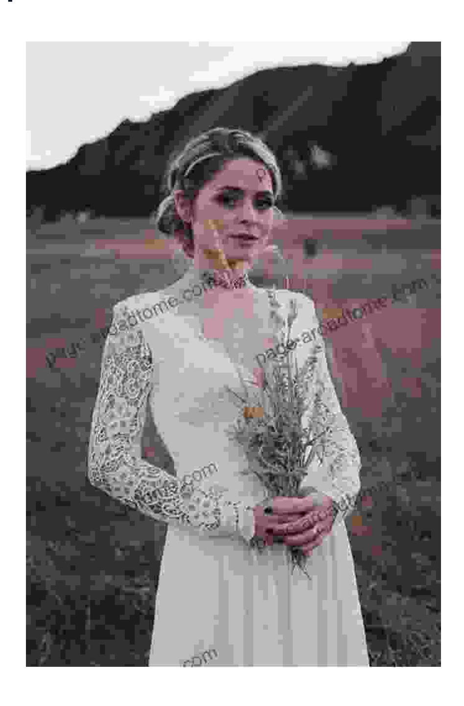
A Literary Masterpiece Weaving Themes of Resilience and Redemption