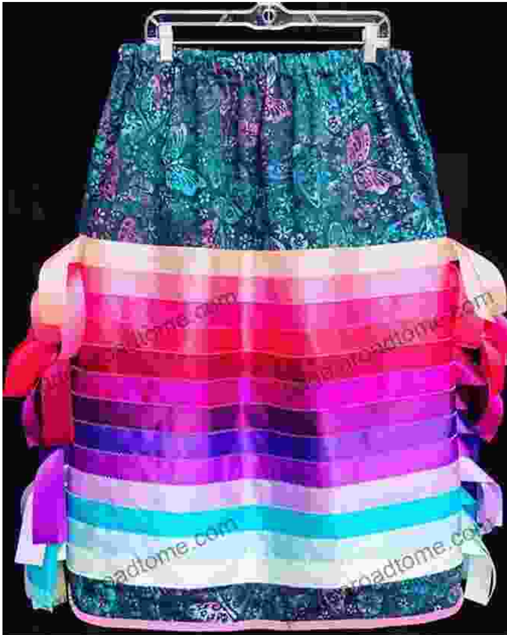
Intricate Beadwork: Echoes of Ancestral Voices