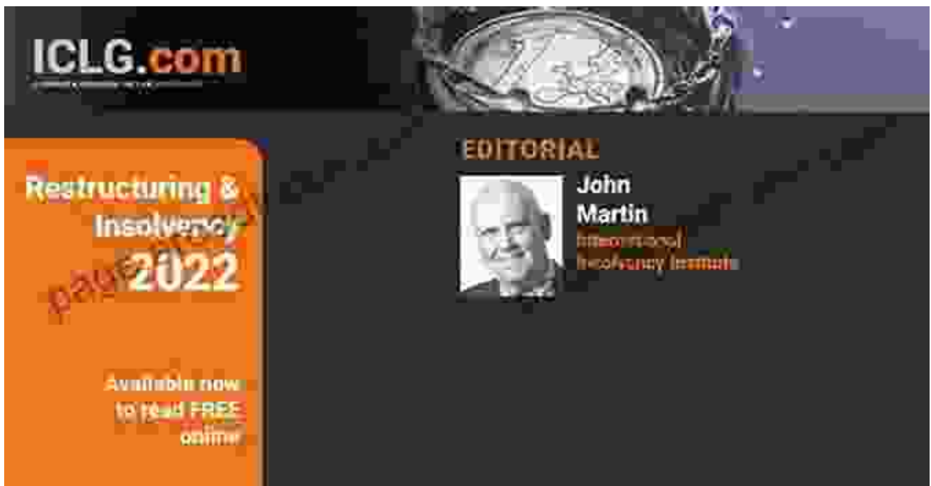
Figure 2: Navigating insolvency across international bFree Downloads

Download licensing agreements. It provides insights on enforcing IP rights, managing cross-border Download assets, and navigating legal disparities.