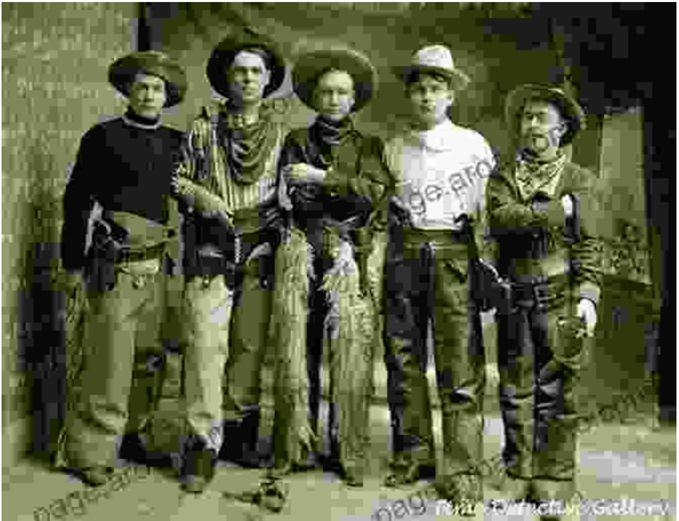
A group of cowboys at a branding corral in the early 1900s.