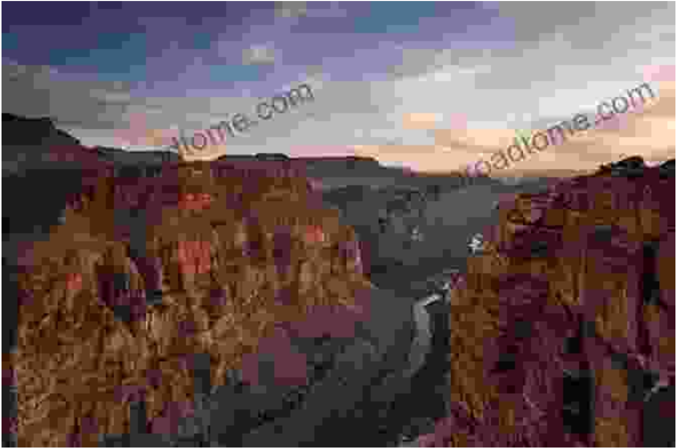
A breathtaking view of the Grand Canyon from the South Rim.