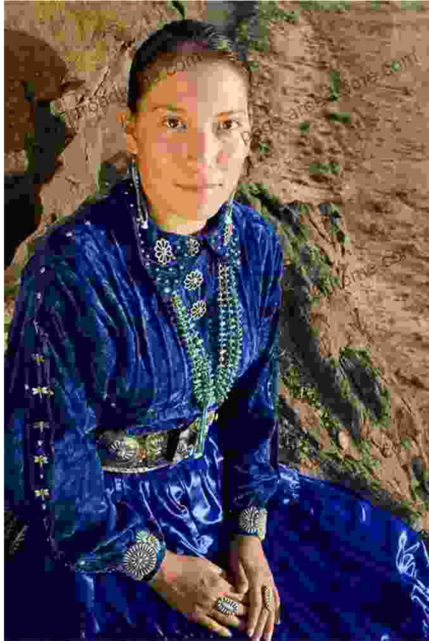
A portrait of a Navajo woman in traditional dress.