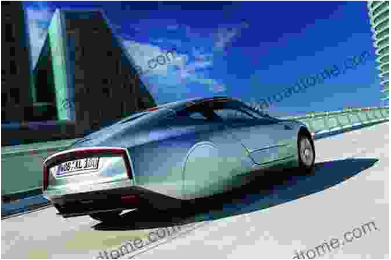
Vision of the Future